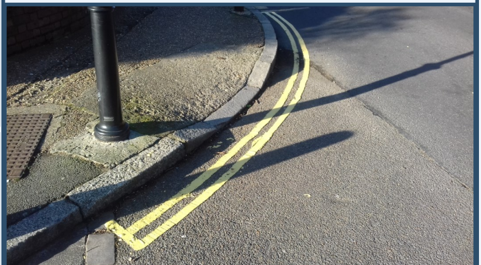
The double yellow lines are to keep the dropped kerb clear.

Parking has improved greatly, thank you. You will notice double yellow lines have now been painted at the junction of Etherow Street and Norcroft Gardens.